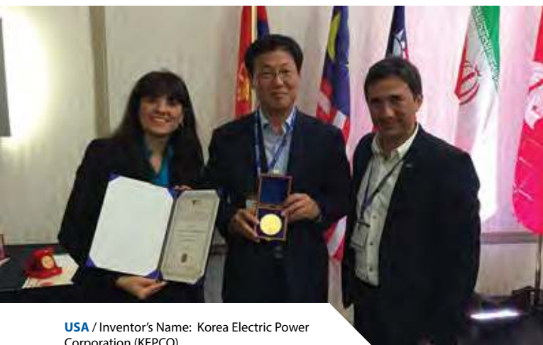
USA / Inventor's Name: Korea Electric Power Corporation (KEPCO)