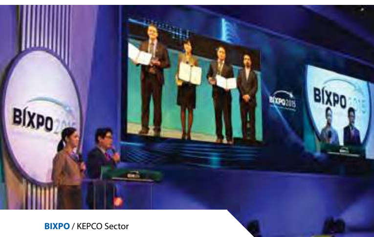
BIXPO / KEPCO Sector