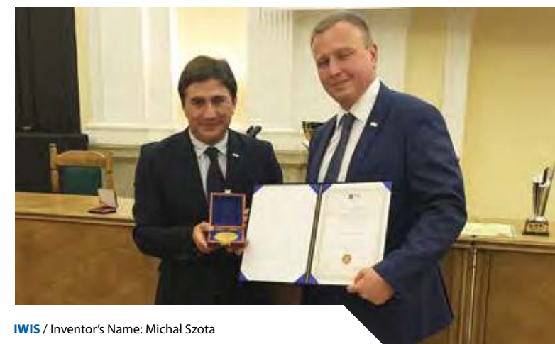
IWIS / Inventor's Name: Michał Szota