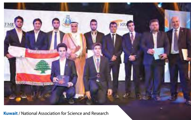
Kuwait / National Association for Science and Research