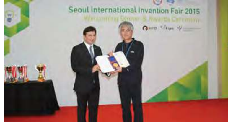
SIIF / Inventor's Name: Yang Seong-mok

In 2015, IFIA best invention medal and certificate was awarded to the greatest inventions showcased in the international invention exhibitions organized under the patronage of IFIA. The best inventions are selected relying on the Jury's evaluation of its novelty, inventive step, potentiality to be commercialized, and its benefit for the mankind.