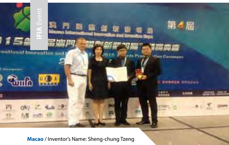
Macao / Inventor's Name: Sheng-chung Tzeng