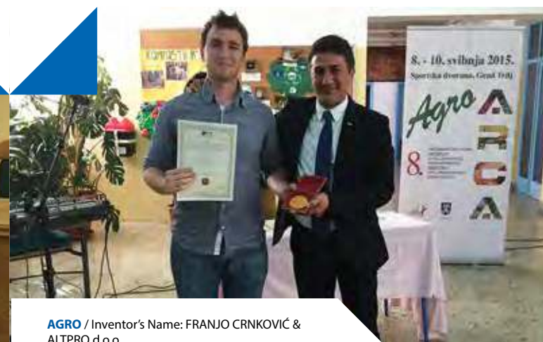
AGRO / Inventor's Name: FRANJO CRNKOVIĆ & ALTPRO d.o.o.