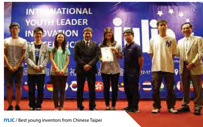
IYLIC / Best young inventors from Chinese Taipei