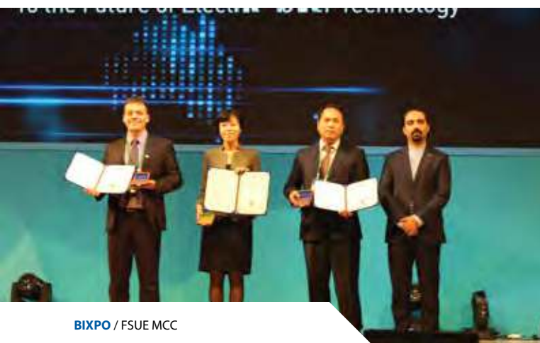
BIXPO / FSUE MCC