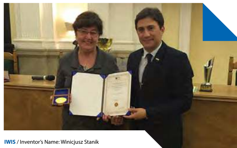
IWIS / Inventor's Name: Winicjusz Stanik