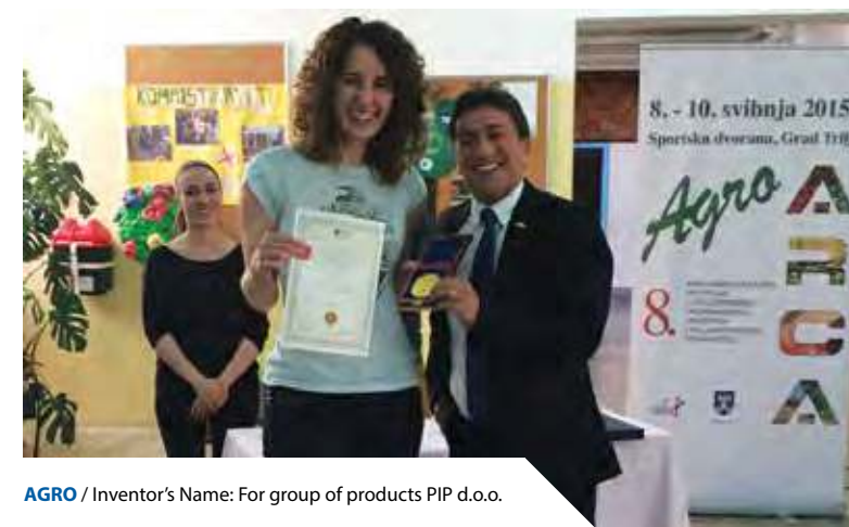
AGRO / Inventor's Name: For group of products PIP d.o.o.