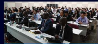
World Bank Energy Forum

* Attended by 300+ on the management level at KEPCO affiliates including KEPCO KPS and those involved in Industry-University-Government collaborations