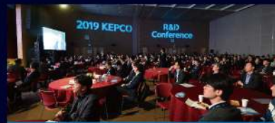
2019 KEPCO R&D Conference

* Attended by 500 professionals including CEOs, CTOs from corporations, R&D institutes, colleges, etc., home and abroad