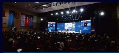
Energy Leaders Summit

34 Academic Conferences 17 New Technology Conferences