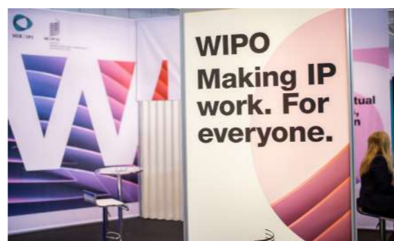
Stand of WIPO (World Intellectual Property Organisation) and IPI (Swiss Federal Institute of Intellectual Property)

The International Exhibition of Inventions of Geneva benefits from the most extensive support and privileges that can be granted to an exhibition. It is under the patronage of the Swiss Federal Government, the State, the City of Geneva and of the World Intellectual Property Organization - WIPO.