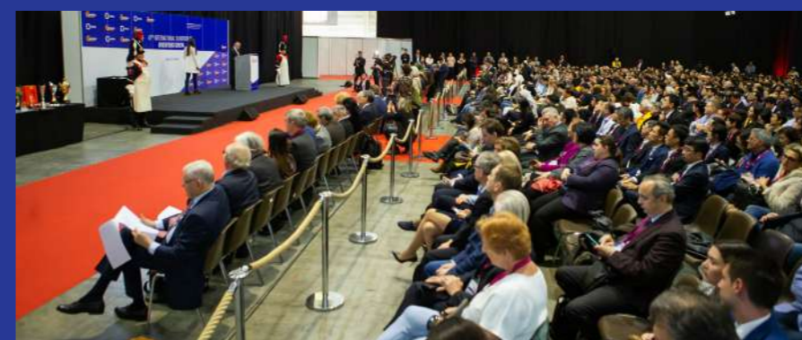
More than 1'000 exhibitors, personalities and journalists participate at the prize-giving ceremony