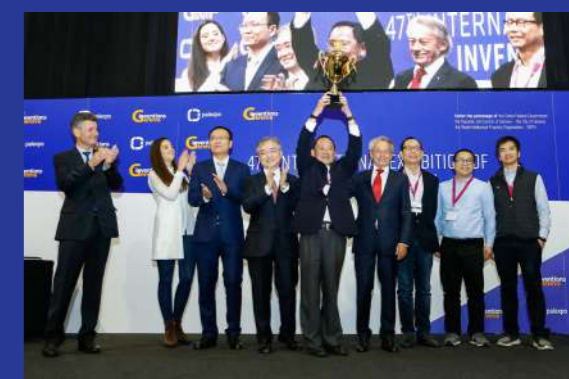
Grand Prix 2019 - for GRST Holdings Limited from Hong Kong for the first recyclable car battery.